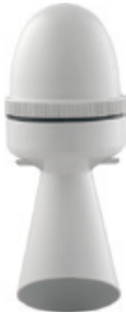
SEM SEM PLUS